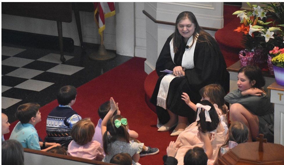
Children's Moment.