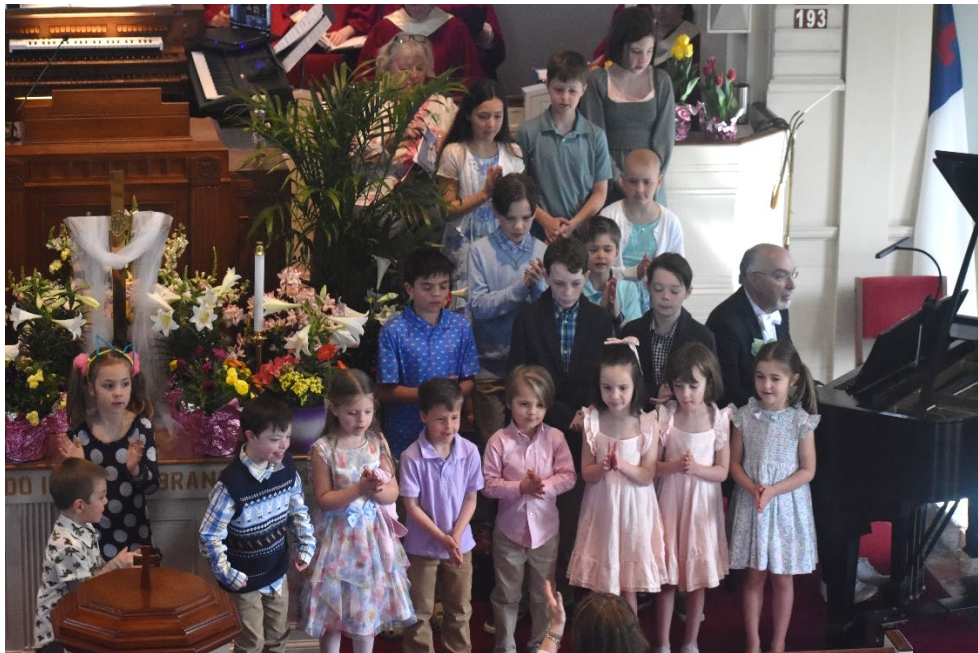
Youth Choir Singing the Introit. 04/20/2025