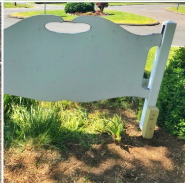
Repairing the Sign. 05/29/2023