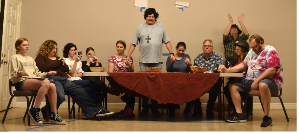
Rehearsal: The Final Luncheon.