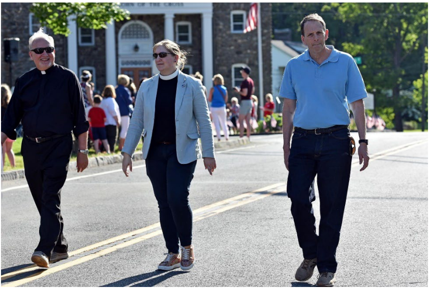
Memorial Day Parade.