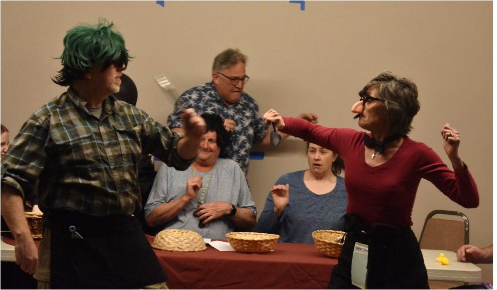
Rehearsal: Battle of the Rubber Ducks.