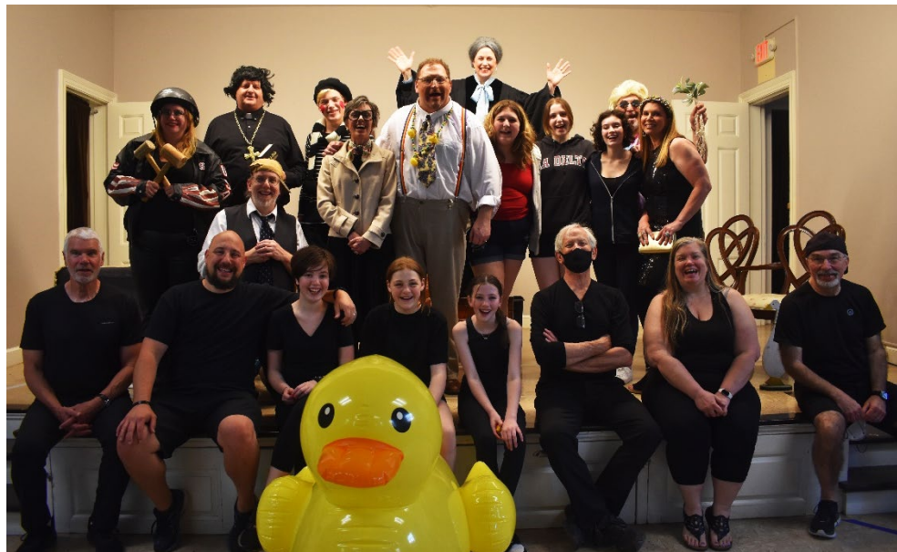
Cast and Crew of "As You Were."