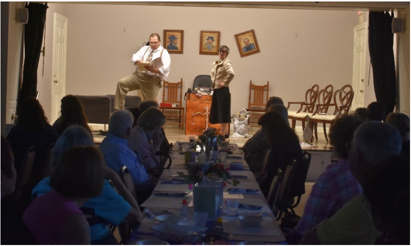
Taking the Case.