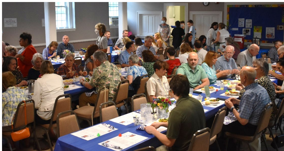
Premier Performance.