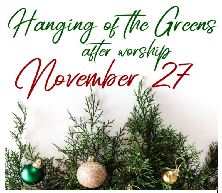
Hanging of the Greens: 11/27 Help decorate the sanctuary for the season after worship!

We have headphones to assist you in hearing the service. Please let an usher know, and they will set you up with a pair.